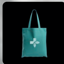
Tote & Wellness Bags