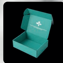
Welcome Cards & Packaging